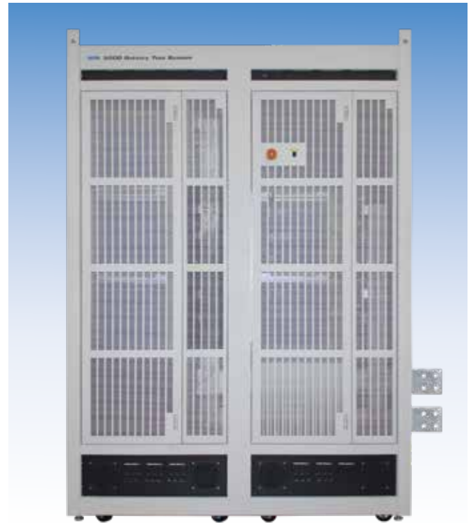
9220 Dual Bay Test System front panel view